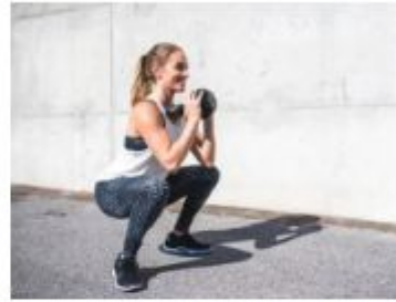
7 Versatile Kettlebell Exercises to Include in Your Workout