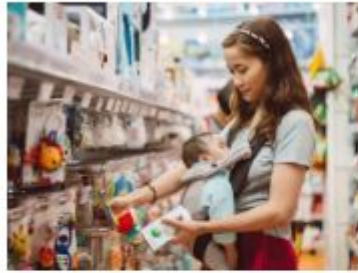
Holiday Shopping Guide: The Best Baby Toys of 2019