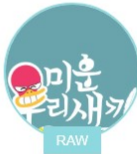
Mom's Diary – My Ugly Duckling Episode 275